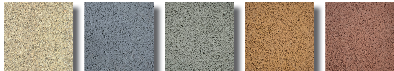
Pure (uncoated) Ice Sage Sand Copper

Due to the natural material, colour variations are possible.