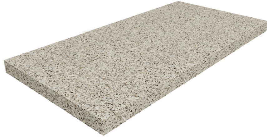
Natura A | nOWAcoustic Hemp straw tile R2 | 600 x 1200 x 30 mm

The surface of the Natura hemp straw tiles has a compressed, natural structure that is created by the special processing of the hemp material. This distinctive product will add warmth and texture to any interior.