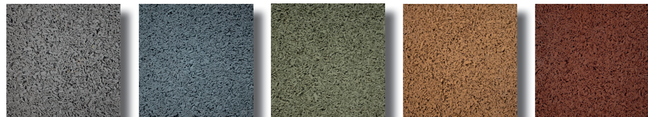
Granit Cobalt Moss Clay Rust

Natura A is available in several natural colour shades – from warm earthy tones to grey variants and soft moss and clay shades. This natural colour palette creates a calm, harmonious atmosphere in the room.