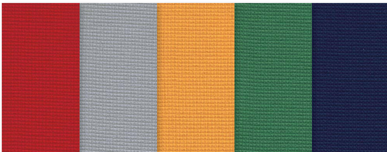
The pictures were taken in the convent of the Benedictine Abbey in Amorbach.